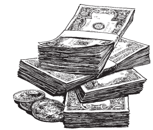
TIMELINE November/December 2005