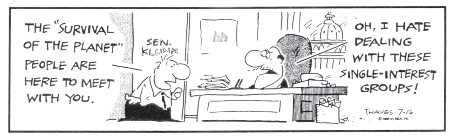
FRANK AND ERNEST

As the masthead on the front cover of this final issue of Timeline indicates, this is Issue No. 84. Beginning with the May/June 1997 issue (No. 34), each issue of Timeline has been archived on the Foundation website at www.globalcommunity.org As a result, this resource of articles, book reviews, and other valuable material will continue to be available to our readers and any other interested individuals throughout the world for years to come.